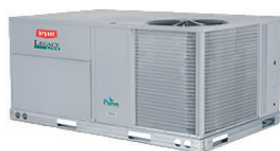
582L / 559L / 547L

Perfect Humidity® is available as a factory option on the following Bryant® Packaged Rooftop Units