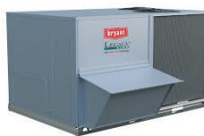
581L / 551L / 549L