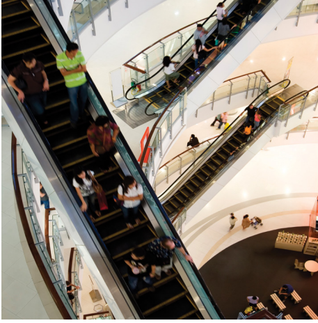
Office Buildings & Commercial Spaces