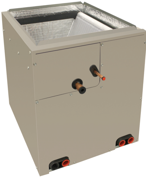
Fig. 1 – CVPVP