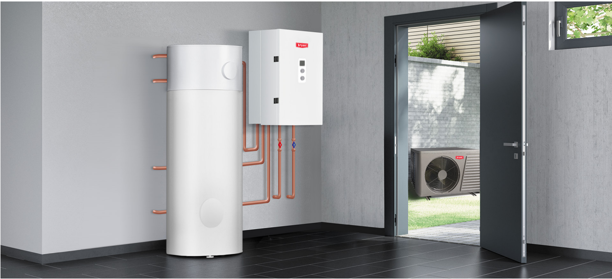
The Bryant domestic hot water air-to-water heat pump system offers a complete solution for residential applications. The optional domestic indirect tanks come in three sizes: 53, 66 or 79 gallons.

The Bryant DHW-A2W heat pump system is a true all-in-one kit with indoor unit, outdoor unit, buffer tank, and domestic hot water tank. The easiest way to add heat pump hot water.