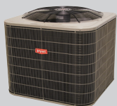
Air Conditioner or Heat Pump

Provides efficient cooling or cooling/heating for comfort and potential energy savings.