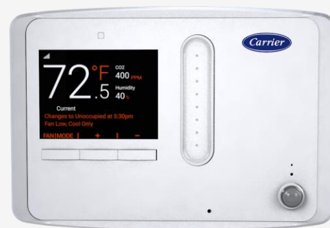
Part # 7C-HS-C2W-X

The HyperStat works out of the box with the ClimaVision intelligent building solution. Replacing non-connected thermostats with the HyperStat's cloud-enabled capabilities is as easy as swapping out the wires. The sleek, contemporary design will look right at home in any space.