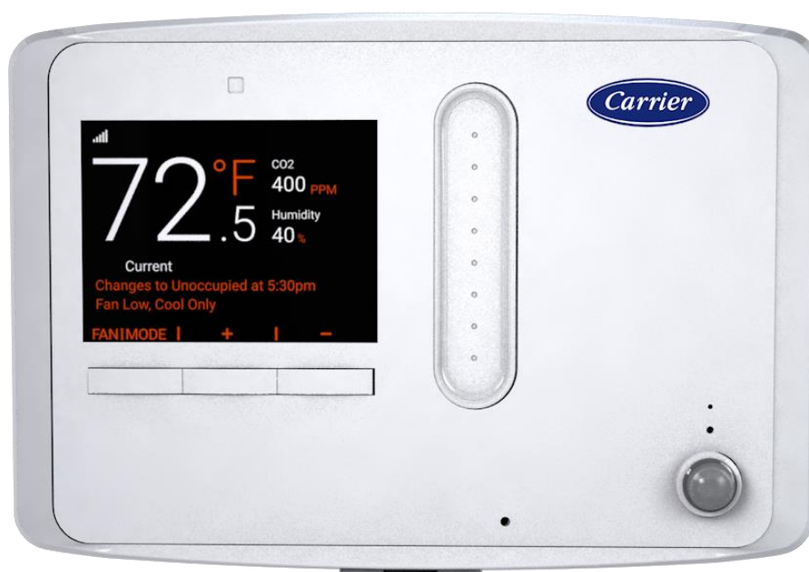
HyperStat | Part # 7C-HS-C2W-X

All-in-one commercial thermostat and humidistat for superior IAQ management and localized temperature control