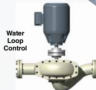
Water Loop Control