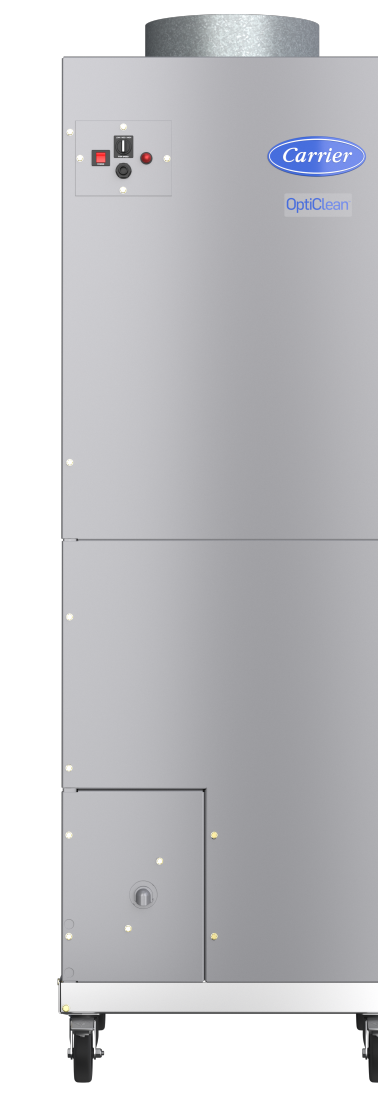
OptiClean 1,500 CFM