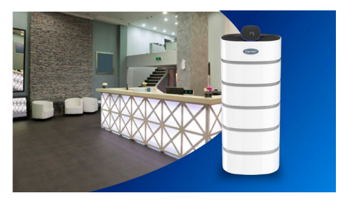
ACTIVE CHILLED BEAMS