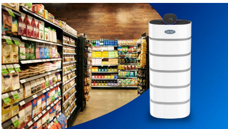
RMAP AIR PURIFIER