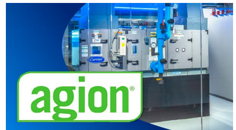
AGION®-COATED AIR-HANDLING UNIT