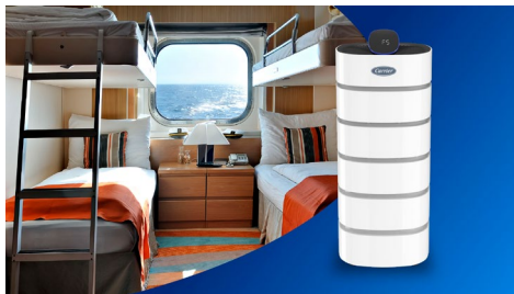
RMAP AIR PURIFIER

Carrier offers a full suite of products and services designed to help create safe and healthy environments onboard today's ships. The following are just a few highlights of our offering.