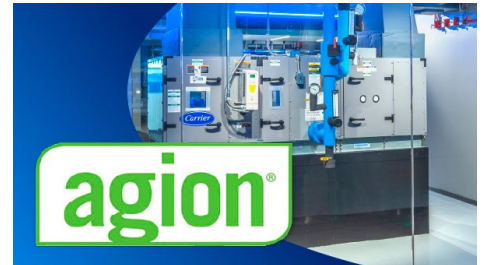
AGION®-COATED AIR-HANDLING UNIT