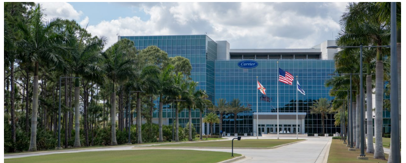
Carrier's Center for Intelligent Buildings is located in Palm Beach Gardens, Florida, USA.

As the inventors of modern air conditioning and a world leader in HVAC and refrigeration solutions, Carrier has a legacy of creating safe and comfortable buildings. Now we're building on that legacy through our Healthy Buildings Program. Our experts have in-depth knowledge and experience in commercial buildings and a holistic suite of healthy building technologies and services to help meet the needs of the industry today and long into the future.