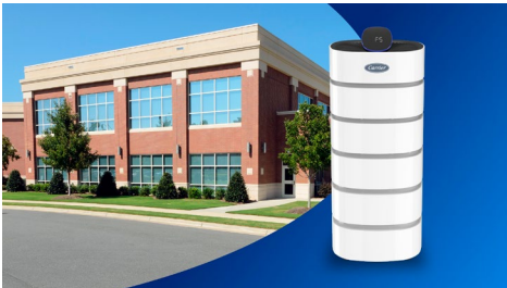
RMAP AIR PURIFIER