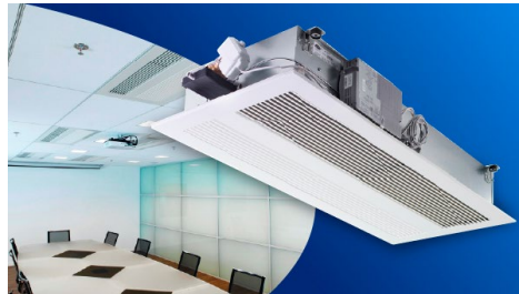
ACTIVE CHILLED BEAMS