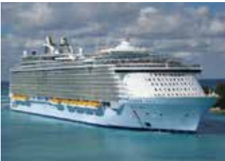
Oasis of the Seas®

UTC Building & Industrial Systems has become a trusted partner for national and multinational companies serving a broad range of market segments. We work closely with our customers to understand continuously changing needs and provide solutions, via our extensive partner network. We fine-tune concepts and product solutions to meet customers' requirements, independent of project size or location and we are proud to share key case studies upon request.