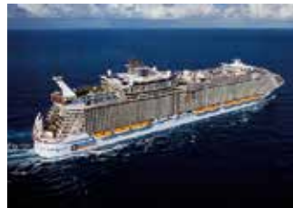
Allure of the Seas®