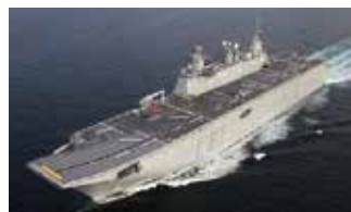
Helicopter Carrier Juan Carlos

Carnival Cruise Lines contracted Marioff to upgrade the fire protection of the machinery spaces on all of its 24 ships with a HI-FOG® full coverage system. The contracts are accomplished as turn-key projects while the ships are in operation. 12 of these are fitted with Autronica fire detection system which are extended in the same occasion.