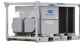
Small Skid Mounted