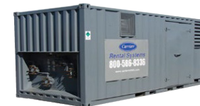
Water Cooled (Containerized)