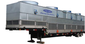
Trailer Mounted High Capacity