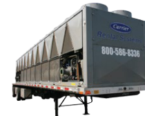
Air Cooled Trailer Mounted