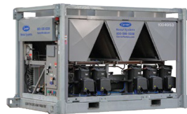
Air Cooled Skid Mounted