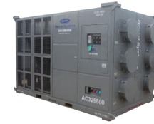
Large Skid Mounted