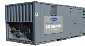
Water Cooled (Containerized)