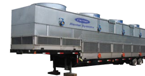
Trailer Mounted High Capacity