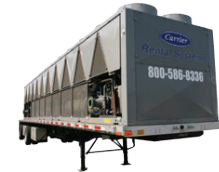
Air Cooled Trailer Mounted