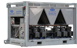
Air Cooled Skid Mounted