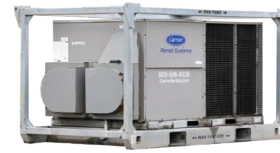
Small Skid Mounted