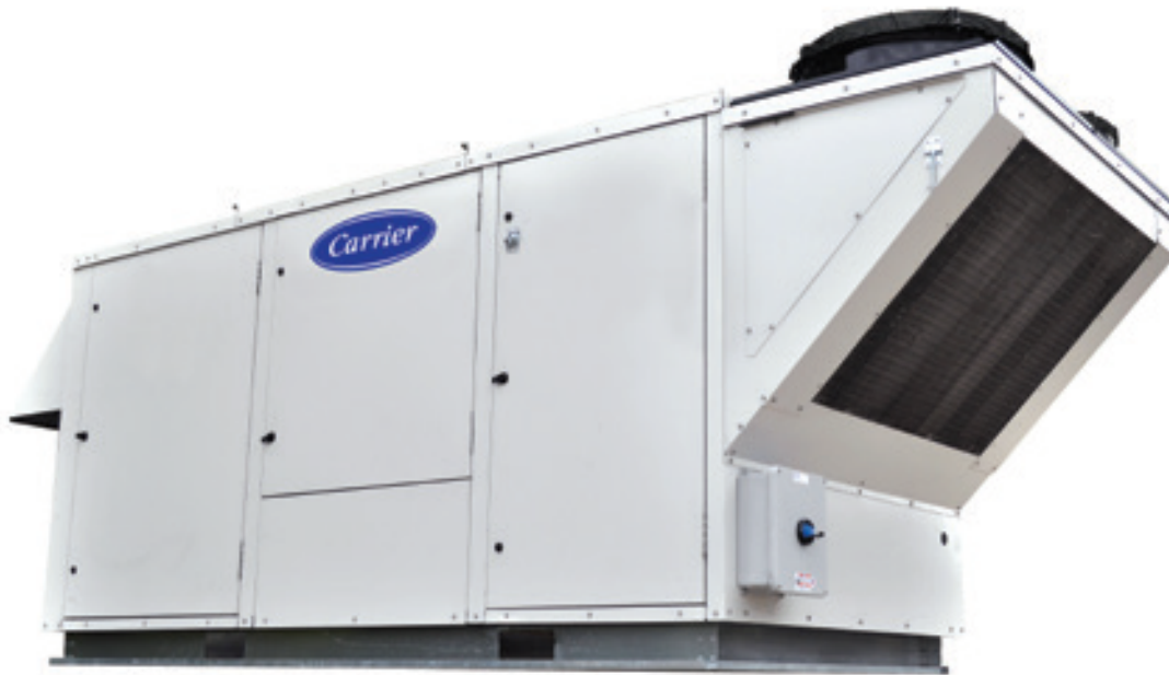
62X03-55 Dedicated Vertical or Horizontal Outdoor Air Units with Optional Energy Wheel