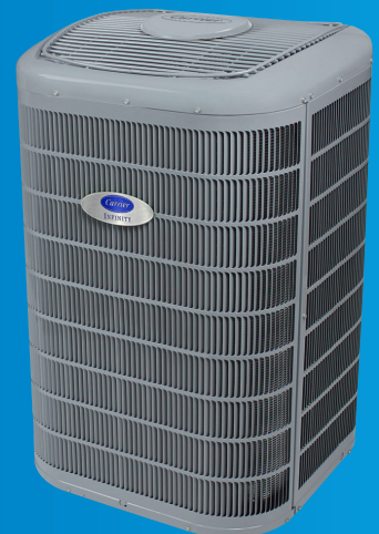
Models 27VNA3, 27VNA1, 27VNA0