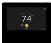
Ion Black System Control

We offer a complete family of products designed to provide year-round comfort, control and efficiency. An Airquest split-system heat pump is a properly matched combination of an outdoor heat pump and a separate indoor unit such as a natural gas, oil, propane or electric furnace or a fan coil. Your Airquest dealer can help create a properly matched system to best fit your needs and your budget.