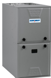
Ion Series Gas Furnaces