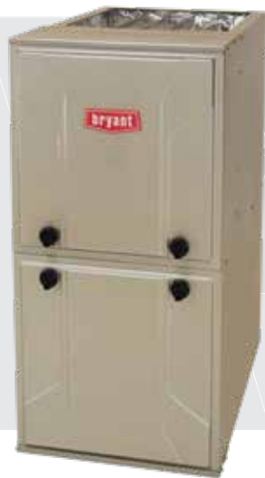
Model 926T and 926S