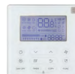
Wired Controller (7-Day Programmable) KSACN0801AAA