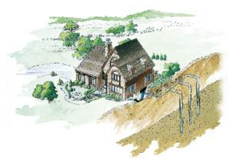
Vertical Loops: Used where land area is limited or soil conditions prohibit horizontal loops. Installed using a drilling rig.