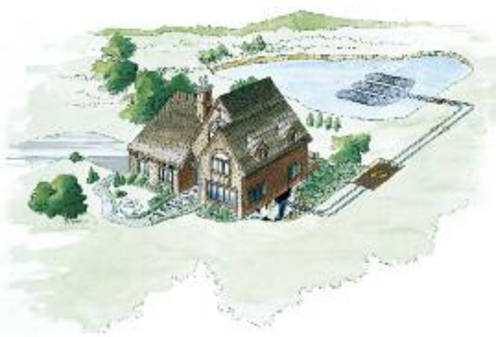
Pond Loops: Coils of pipe are fabricated and sunk to the bottom of the pond.