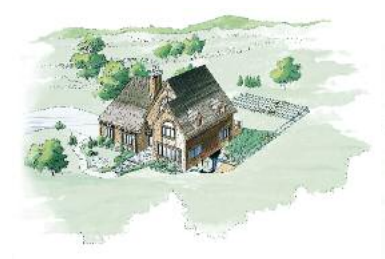
Horizontal Loops: Used on larger lots. Installed using a backhoe or trencher.

Geothermal systems can be installed with a variety of loop system configurations. "Closed loops" use re-circulated fluid in a series of pipes installed vertically, horizontally, or in a pond. "Open loops" use well water. Your dealer will determine which design works best for your home.