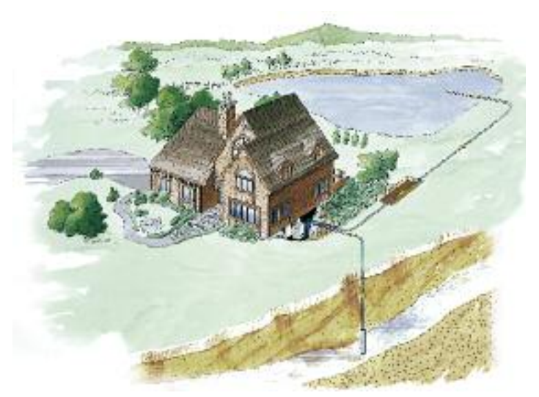
Open Loop: Well water from an existing well can be used, then discharged into a drainage ditch or pond.