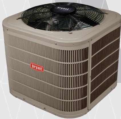
Models 227T, 225S