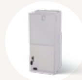
AIR HANDLER 45MBAA

1 The 45MPHA indoor unit is compatible with the following Infinity heat pumps: 37MPRA and 37MGHA.