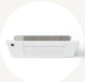
ONE WAY CASSETTE 45MCCA