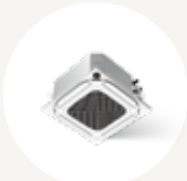
4-WAY CASSETTE 45MBCA

Cassettes offer quiet, even airflow without taking up wall or floor space, ideal for open layouts and multi-use rooms.