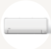
PERFORMANCE HIGH WALL 45MAHA