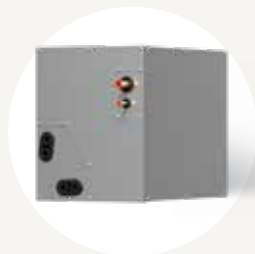
45MULA EVAPORATOR COIL

It's no secret that ductless and traditional HVAC systems each have their own set of advantages. So why not reap the benefits of both?