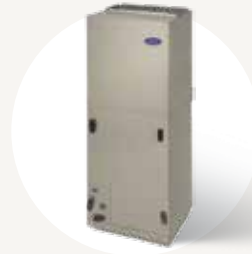
RESIDENTIAL FAN COILS¹