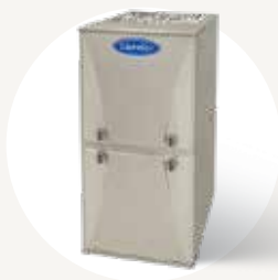
RESIDENTIAL GAS & OIL FURNACES¹