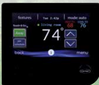
Infinity® System Control

* Full Infinity® System with the Infinity System Wall Control with Wi-Fi® capability. Remote access requires Wi-Fi model wall control and Apple™ or Android™ mobile device. Energy Tracking requires compatible equipment. Wi-Fi® is a registered trademark of Wi-Fi Alliance Corporation.