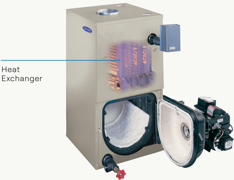
PERFORMANCE 86 OIL BOILER MODEL BW5 SHOWN

Both our Performance 86 oil boilers, models BW5 and BW4, provide dependable heating and energy-efficient comfort backed by one of the most trusted and recognized names in comfort: Carrier.