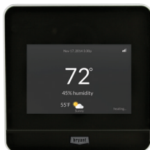
Housewise™ Wi-Fi® Thermostat

The Housewise thermostat is part of a new breed of comfort management devices that saved homeowners an average of 20% on their heating and cooling energy costs. With Wi-Fi® capability, you can access your system 24/7 from almost anywhere and view detailed energy reporting from your tablet or web portal. Combine that with custom energy tips and you can make informed decisions about when and how to save even more money.