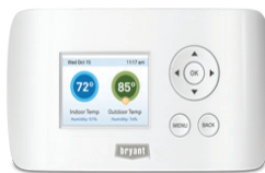
Bryant® Wi-Fi® Thermostat

This thermostat is about more than simply giving you remote access. It's about helping you save money on energy through advances in programming design, smart recovery and energy-use reporting. You can see when you're spending the most on energy and tailor your settings to save. And, when you're not home, this thermostat will work to heat or cool the most efficient way possible for your system type and brand.