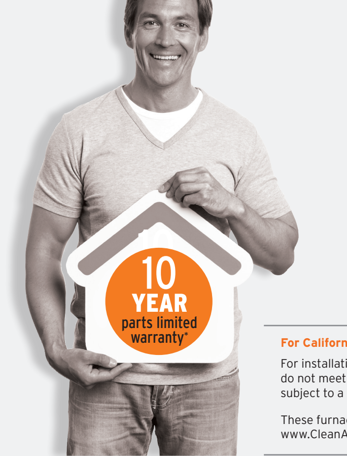
*Warranty period is 5 years if not registered within 90 days. Jurisdictions where warranty restrictions are not allowed will automatically receive a 10-year parts limited warranty. See warranty certificate at payne.com for complete details.

These furnaces are not eligible for the Clean Air Furnace Rebate Program: www.CleanAirFurnaceRebate.com.