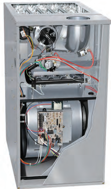
N80 Gas Furnace

*To the original owner, Arcoaire products are covered by a 10-year parts limited warranty upon timely registration. The limited warranty period is five years if not registered within 90 days of installation except in jurisdictions where warranty benefits cannot be conditioned upon registration. See warranty certificate for complete details.