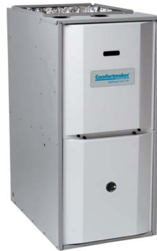
Illustrations and photographs are only representative. Some product models may vary.

* Applies to original purchaser/homeowner, some limitations may apply. See warranty certificate for complete details.