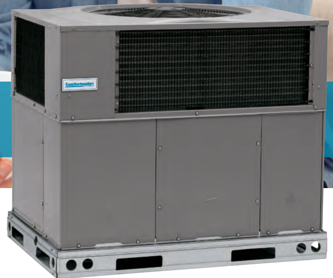
Performance Series PAD4/PGD4

Timely registration required. See warranty certificate for details and restrictions.