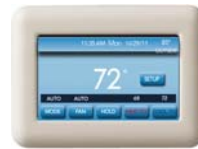
TSTAT0201CW Recommended (sold separately)

* Applies to original purchaser/homeowner, some limitations may apply. See Warranty certificate for complete details.