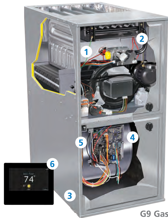
G9 Gas Furnace

Airquest gas furnaces are designed for durability and comfort. The warmth and efficiency of natural gas combined with a quiet, efficient blower motor delivers comfort throughout the cold seasons. The gas furnace can also be combined with an indoor evaporator coil and properly matched outdoor air conditioner or heat pump to provide cooling during the warm seasons.