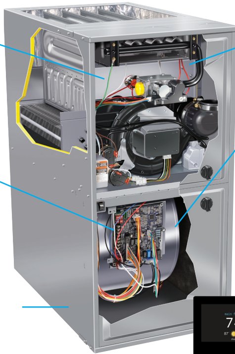
90% Gas Furnace

Quiet – Solid, pre-painted steel insulated cabinet with tight-fit door latch, isolated blower motor, and soft-mount rubber gaskets on key components contribute to quieter operation.