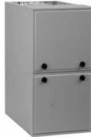
Illustrations and photographs are only representative. Some product models may vary.