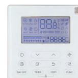
Wired Controller (7-Day Programmable) KSACN0901AAA