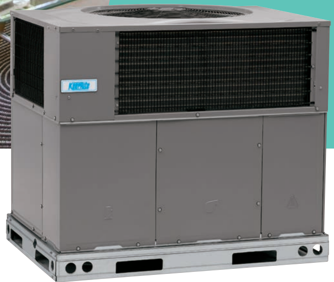
QuietComfort® Series PGS4**2 Performance Series PGD4**2

KeepRite® Heating & Cooling Products The Pros Know.