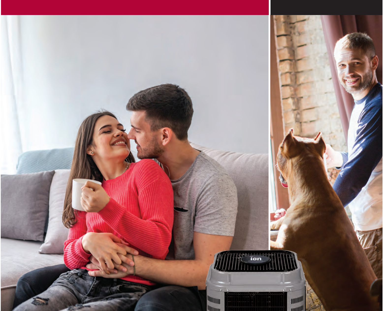
Ion™ 18 Heat Pump with SmartSense™ Technology HVH8

Arcoaire® Air Conditioning & Heating Enduring Performance.