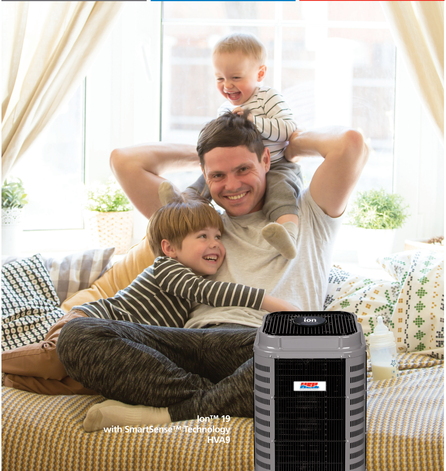
Ion™ 19 with SmartSense™ Technology HVA9