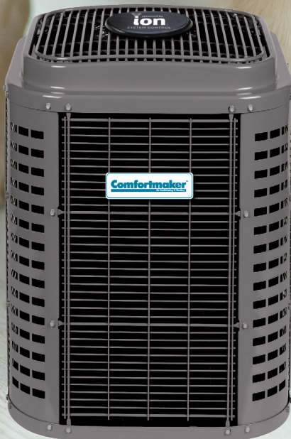
Ion™ 18 Heat Pump with SmartSense™ Technology CVH8