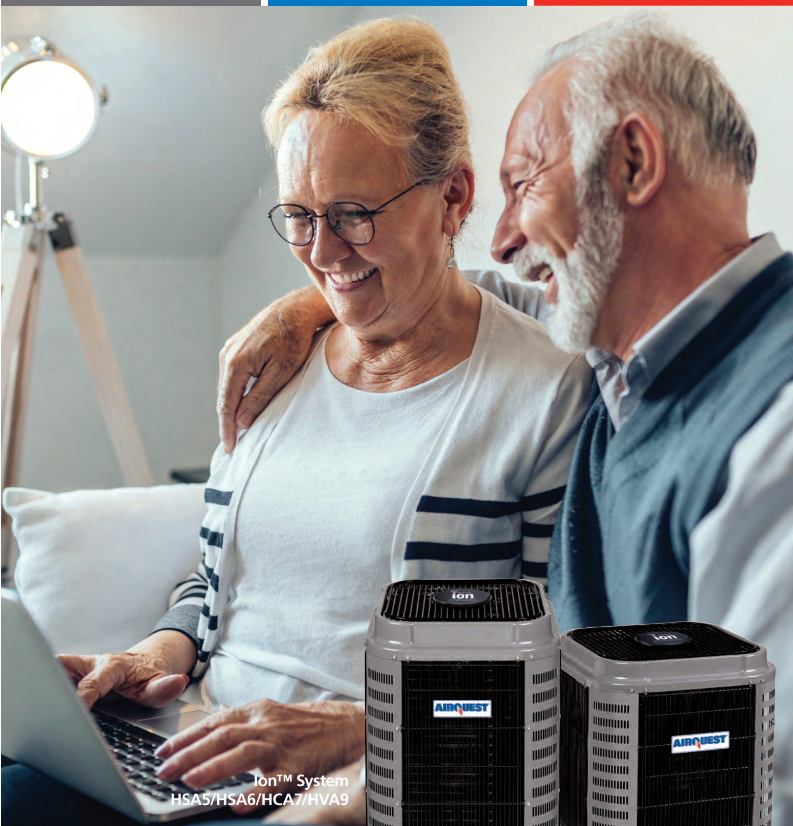
Ion™ System HSA5/HSA6/HCA7/HVA9