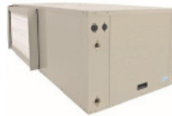
Illustrations and photographs are only representative. Some product models may vary.