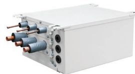
Branch Box Required on Sizes 48 & 56