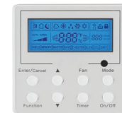
Optional Wired Controller KSACN0201AAA Not available for DLFA & Floor Console