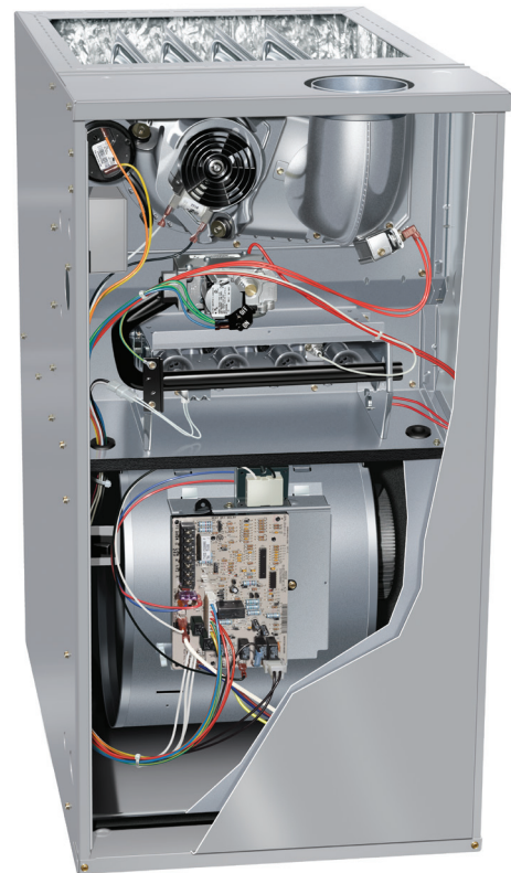
N80 Gas Furnace

*To the original owner, Arcoaire products are covered by a 10-year parts limited warranty upon timely registration. The limited warranty period is five years if not registered within 90 days of installation except in jurisdictions where warranty benefits cannot be conditioned upon registration. See warranty certificate for complete details.