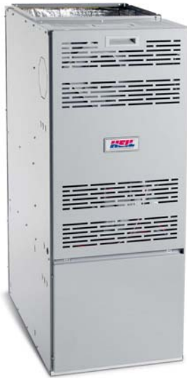
Illustrations and photographs are only representative. Some product models may vary.