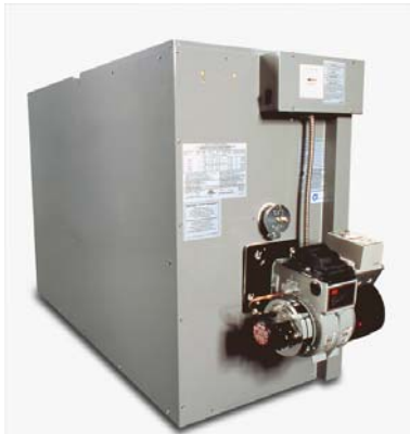
Illustrations and photographs are only representative. Some product models may vary.