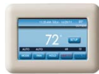
TSTAT0201CW Recommended (sold separately)

* For owner occupied, residential applications only. See warranty certificate for complete details and restrictions, including warranty coverage for other applications.