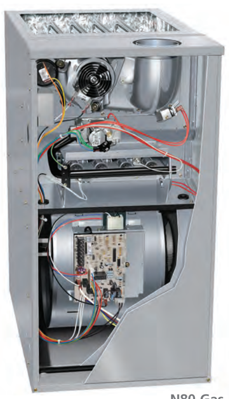
N80 Gas Furnace