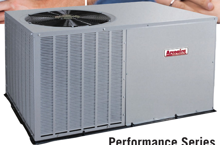
Performance Series PAJ4/PHJ4

When you choose Arcoaire® heating and cooling equipment, you get rugged reliability with energy-saving efficiency in every unit. Our products are 100% run tested, and we design our products to give you the best in engineering and quality manufacturing for lasting performance and comfort. It's our tradition to deliver products that exceed your expectations for enduring performance.