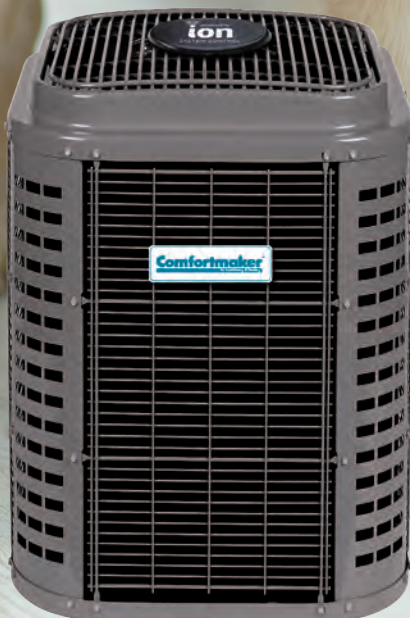
Ion™ 18 Heat Pump with SmartSense™ Technology CVH8